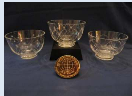
The awards are proudly displayed.

We look forward to hosting you at the 5 th World Congress on Ego State Therapy in February 2013 in South Africa. Please visit www.meisa.biz for more information.