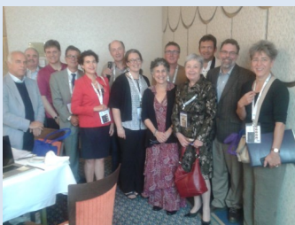
The ISH Board of Directors in Budapest, Hungary.