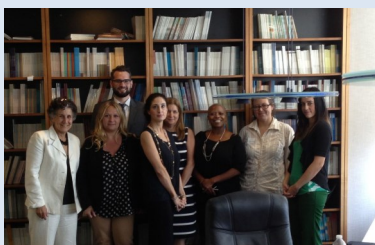
Staff at Taylor and Francis Publishing house meet with ISH President and Administrator to enhance IJCEH benefits.

In general, we, as THD, are very hopeful and excited about the studies of this commission. We believe that all these efforts will have fruitful results and lead to a better future of hypnosis with the recognition of the Government as a legal and valid complementary treatment method.